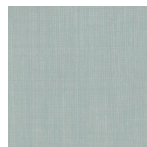
Classic Cut 43111 / Rain Dance