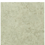
Mountainscapes 88021 / Oyster