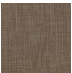
Classic Cut 43105 / Tweedy