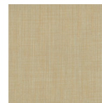
Classic Cut 43102 / Smart Blonde