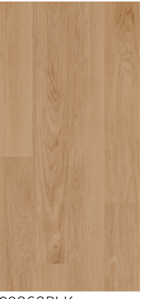
88060PLK Light Fawn